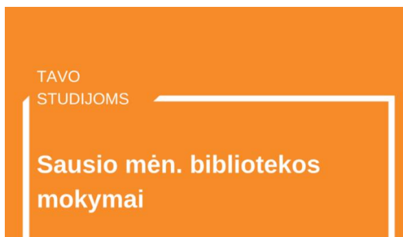
Sausio mėn. bibliotekos mokymai